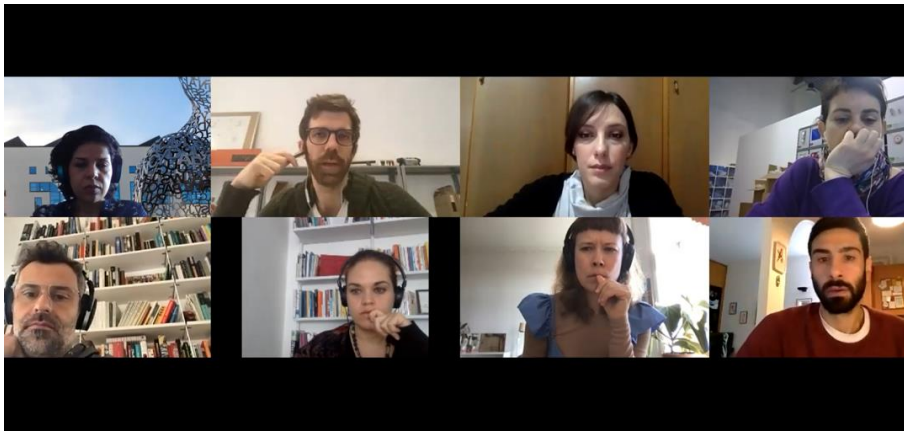
DESTEX partnership during the Transnational Project Meeting

Last March 18 th took place the third transnational DESTEX project meeting. This time, virtually. The partnership reviewed the hackathon platform as well as the virtual training platform .