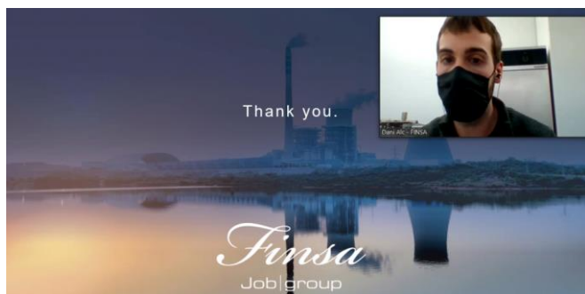
First virtual hackathon

DESTEX team has organized a series of three hackathons . To validate the platform, DESTEX team has involved textile companies that set challenges for the participant students to find potential solutions within 24hrs through team groups.