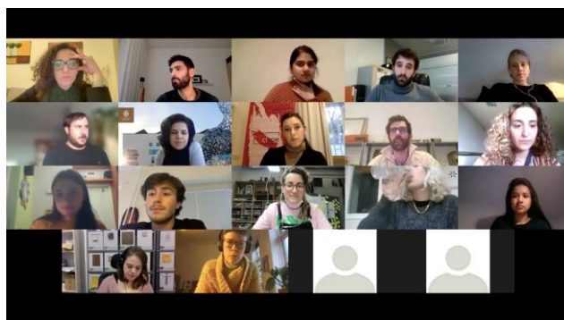
Second virtual hackathon

The winning teams got a free-pass to the DESTEX summer school that will be held in Milan in June 2021.